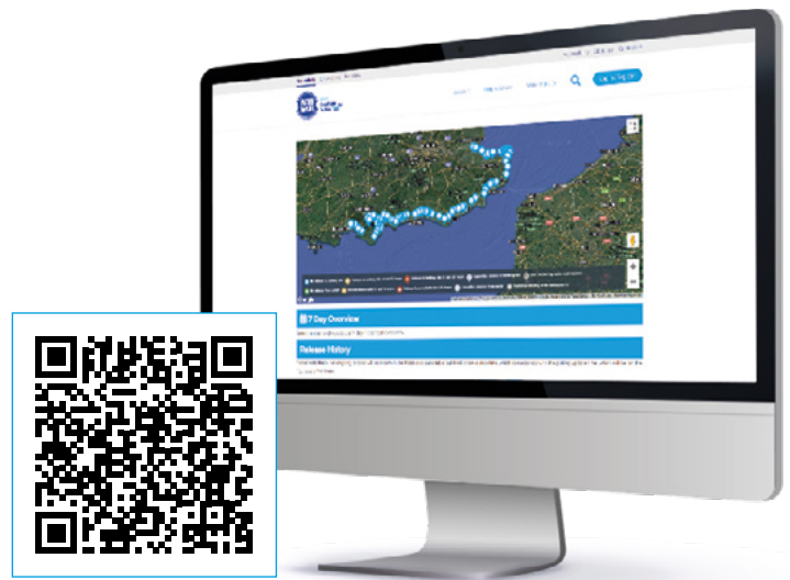
▲ Beachbuoy , our near real-time storm overflow activity tool

Most storm releases are heavily diluted wastewater – up to 95% is rainwater. Storm overflows are not manually operated, they work automatically to release excess water, for example after heavy rain has filled the sewers. These releases are permitted by law and we report all spills to the Environment Agency. Our industry is heavily regulated by the Environment Agency, which sets the permits on storm overflows.